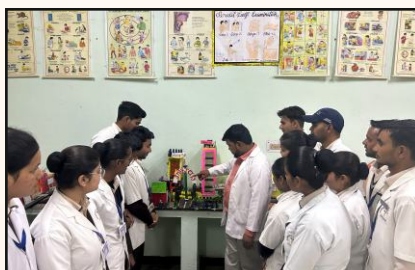
COMMUNITY HEALTH NURSING LAB