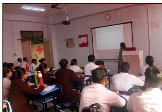
LECTURE HALLS & CONFERENCE HALL

Well furnished & ventilated building, equipped with modern teaching aids provide comfortable & conducive environment for learning.