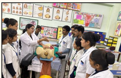
METARNAL & CHILD HEALTH LAB