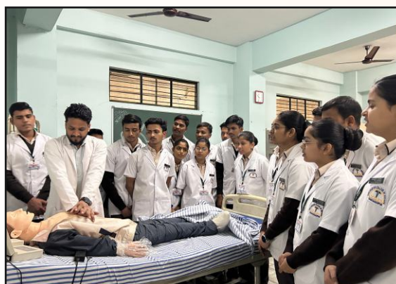
ADVANCE NURSING SKILLS LAB